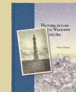
Historia di Faro na Westpunt Aruba Romulo F. Fingal